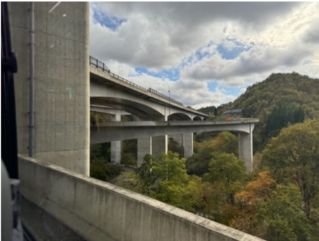
Roundabout Japanese style somewhere