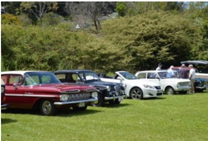
Cars at Coramba Bush Fire Shed

Saturday morning started with a nice morning tea in the Pavillion. David travelled with us on the rally which went Northwest, crossing over the by-pass road works, past a few banana plantations and blueberry farms into the forest through lovely countryside in the Upper Orara Valley to Coramba Bush Fire Shed for lunch.