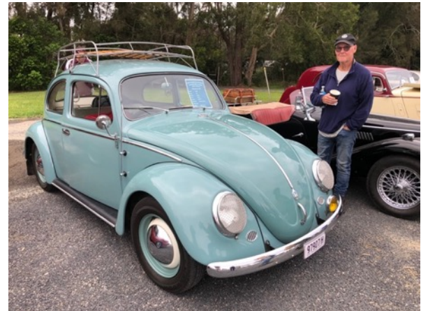
A very nicely restored 1959 VW