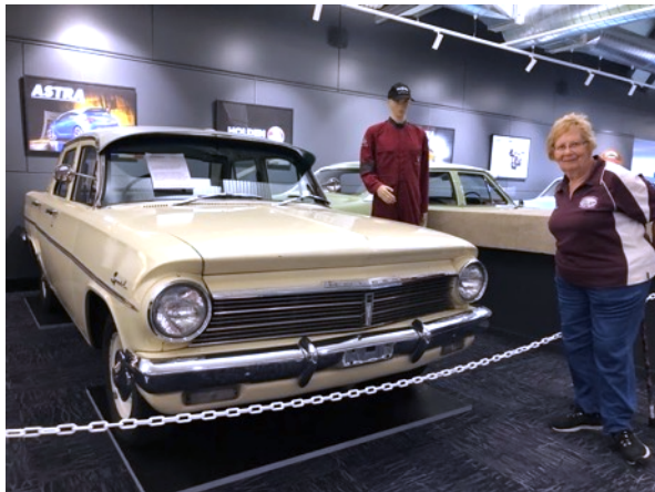
1964 EH Holden same colour as ours Latrobe Cream