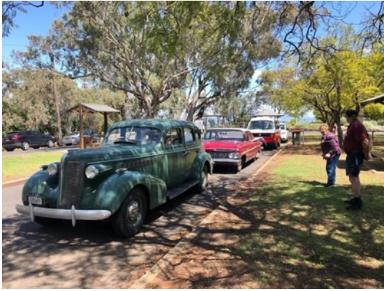
At the Lookout before going to Woolomin