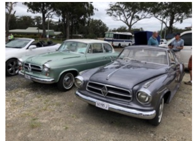
Two Borgward Isabellas

In the afternoon we had a look at 'The Bunker Museum' which had a series of cartoons in it and recently has added historic Holden cars, some from the Echuca Museum which has closed down (we went there in 2019).