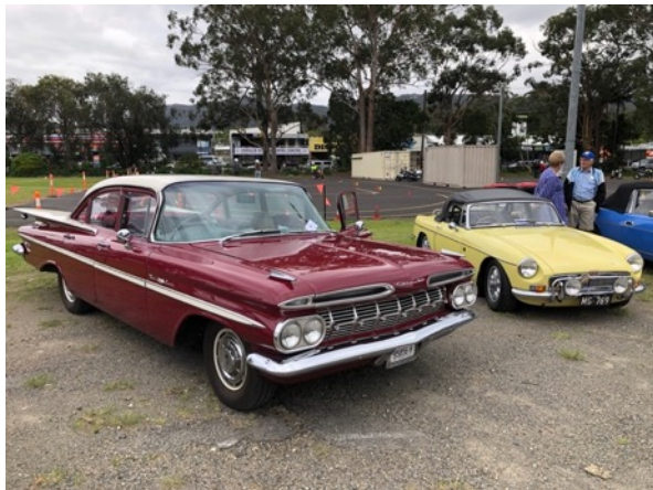
Grout's big 1959 Chev alongside a small MG