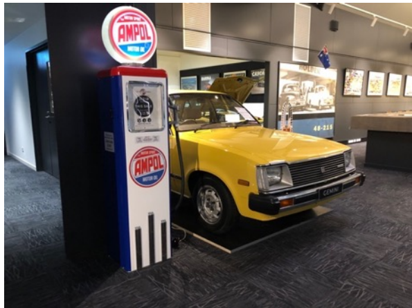
Ampol bowser and a Gemini