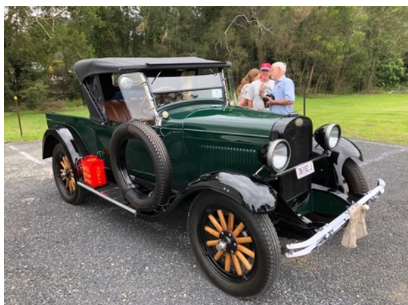
People's Choice Winner Phil Constables '28 Chev