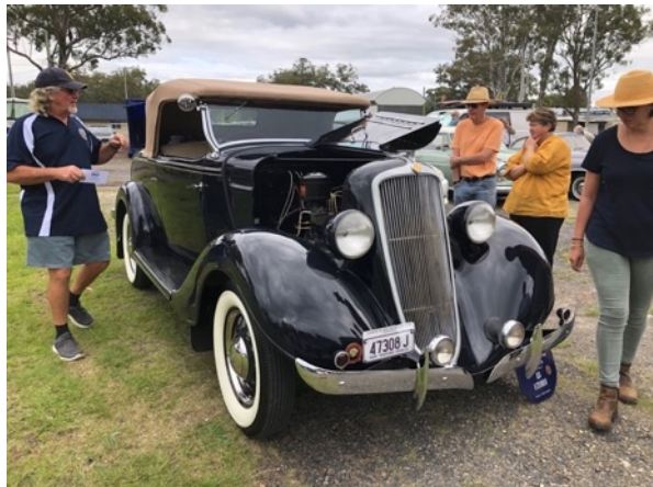
Poulter's 1935 Graham Roadster