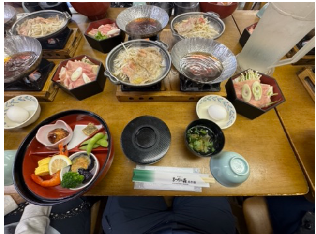
Traditional Japanese lunch cook your own in front of you

Dirt bike for sale: Runs a little Ruff Missing 2 nuts