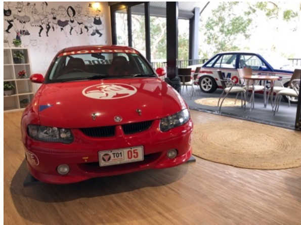
In the Bunker Holden Museum