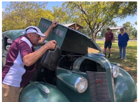
Time to water the Buick