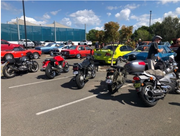
Nice roll up of motorcycles at Bunnings