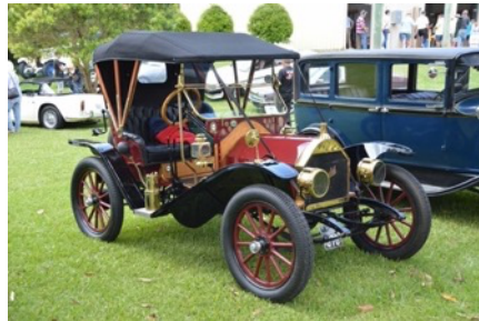
1909 Hupmobile next to 1929 Desoto