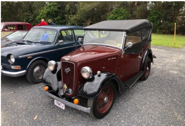
1937 Austin Seven