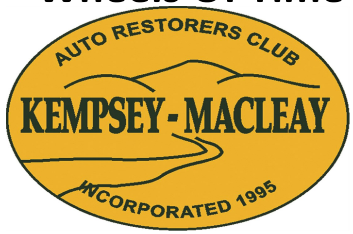
Website http;//www.kmarc.org au