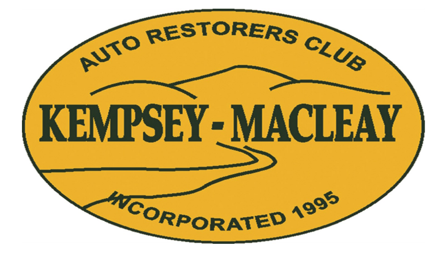
Our website http://www.Kmarc.org.au