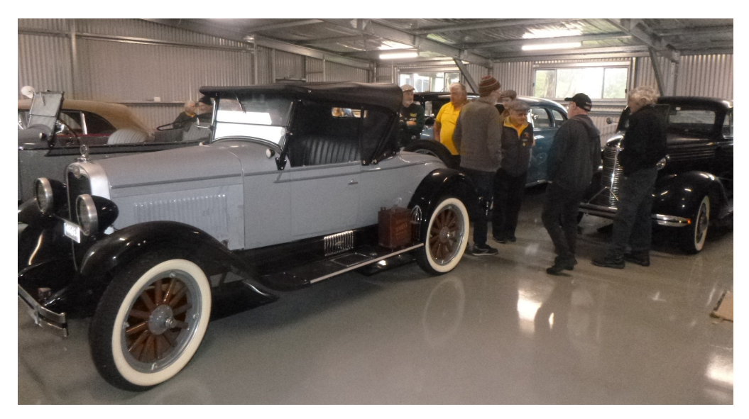
Inside the Garage at Scotts Hd.Members admiring these magnificently restored vehicles. Bottom photo is at Gumma