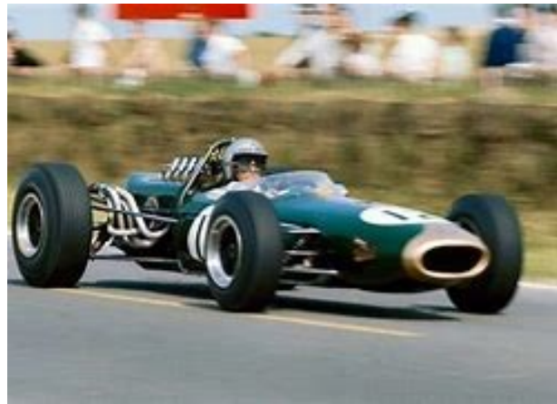
1966 Dutch GP

false beard and leaning on a cane. He went on to win the race. Brabham confirmed his third championship at the Italian Grand Prix and became the only driver to win the Formula One World Championship in a car that carried his own name. Brabham retired