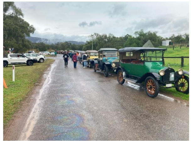
Morning tea Stop at Jerrys Plains

Friday morning saw the arrival of the other entrants and after morning tea we set off for Branxton on the Wine Country Drive before turning left and meeting the Hermitage Rd, which took us out to the New England Hwy. We travelled on this for less than a kilometre, crossing to the northern side of the Hwy and driving a circuit back to Branxton and parking in the Branxton Park. Lunch was purchased from the delightful bakery, only a short walk from the park where the cars were attracting some attention from the public.