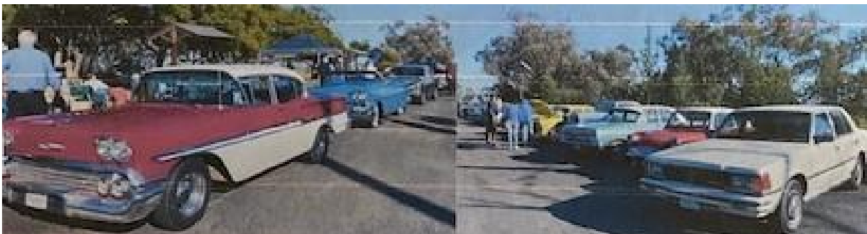
Chevys and a Bently

TDAMC Rally joined up with another of Tamworth's Historic Car Clubs at Mt Oxley For Morning Tea, and what a great display it made for all.