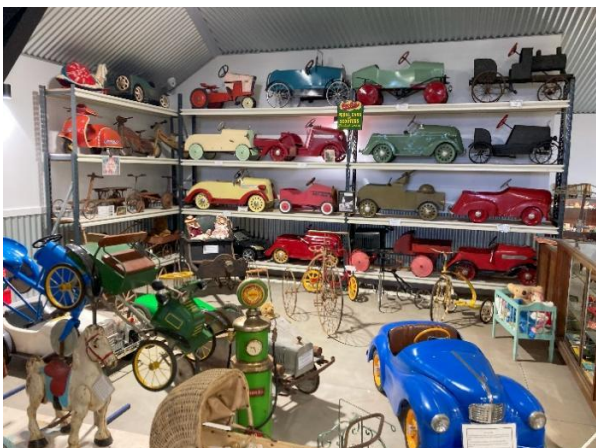
Pedal car display Denman

Sunday's weather was much more enjoyable for the run out to Bulga and back around the foothills to Broke where we gathered for our last group meeting and morning tea. Those that drove their cars to Nulkaba headed directly home, with the rest heading back to Nulkaba to end the tour. After transferring luggage and parking the Essex, a quick cuppa and goodbyes, we headed home with a new appreciation of veteran motoring in a relatively closed car.