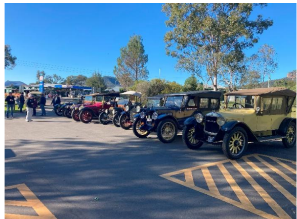
Sunday morning tea stop at Broke