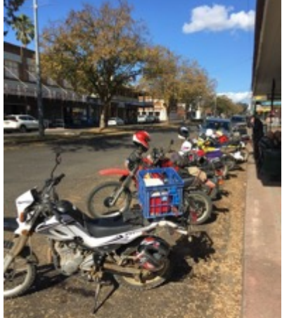
At Manilla Bakery for lunch

easily avoided if paying attention. Country looking good and roads not that dusty. About 200kl today, no falls and good company so a good time was had by all. Home by about 4pm.