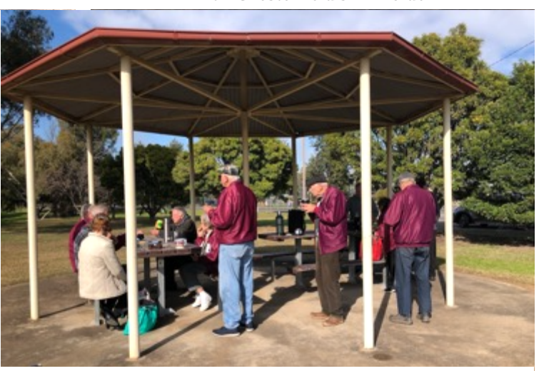
Morning tea time at Attunga Park

After morning tea we travelled from Attunga to Davidsons Lane, Moore Creek Rd, Browns Lane, Forest Rd, Bligh St to the North Tamworth Bowling Club for lunch.