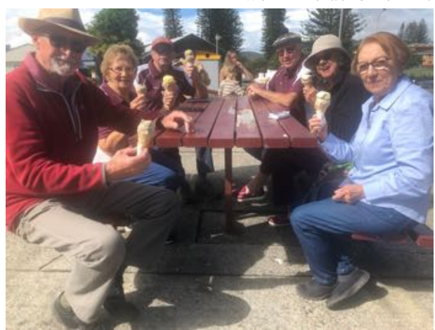
Icecream time at South West Rocks