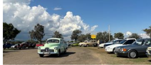
Cars rolling into Somerton Pub car park, while the clouds were rolling in over Tamworth