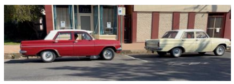
Red EH Holden finally made it to Manilla

We went the long way to Manilla via Wallamore Rd, Appleby Lane then onto Manilla Rd. Meanwhile the red EH didn't have any cars to follow so turned left (instead of right on instructions) and ended up on Oxley Hwy and back into Tamworth. So then they went straight out Manilla Rd after taking the extra long way to Manilla.