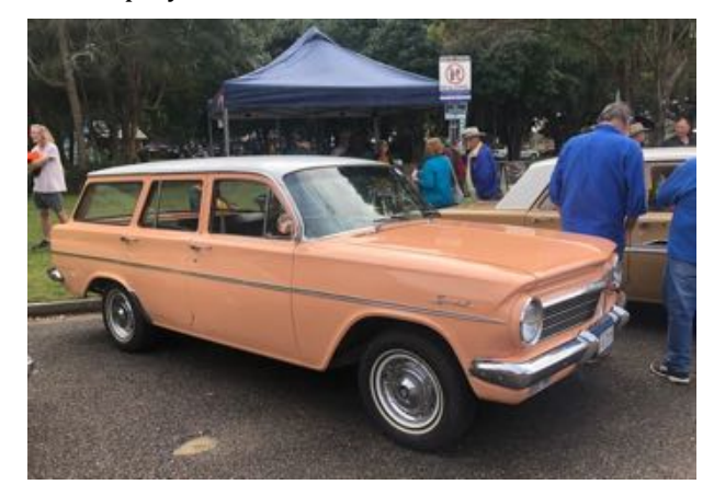
Two EH Holdens from Hastings Auto Restorers Society