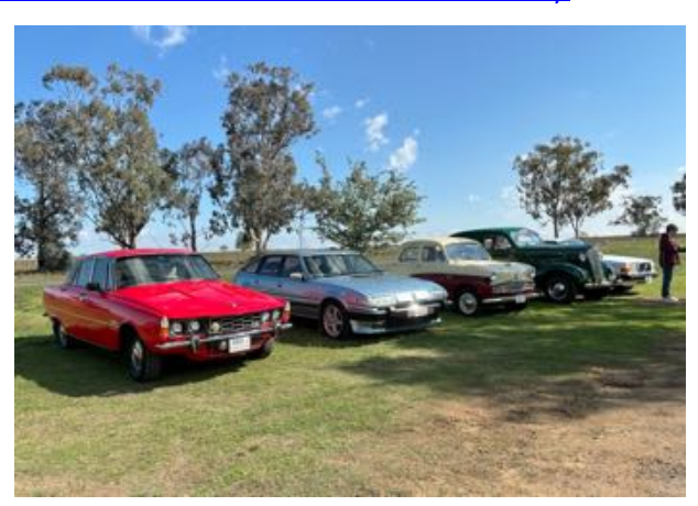
A few of the cars at Somerton Hotel