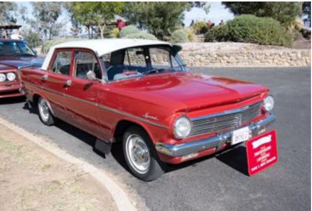
A few of the Halfway Rally cars at the Oxley Lookout