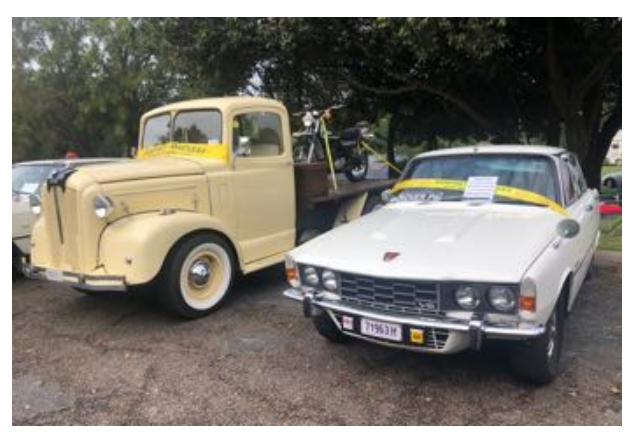
A few of the vehicles on show at the Kempsey Riverside Markets