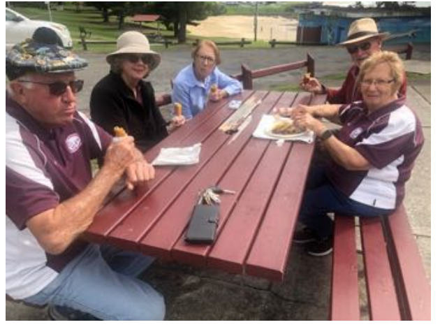
Did you ask for a Chiko Roll or was it a spring roll