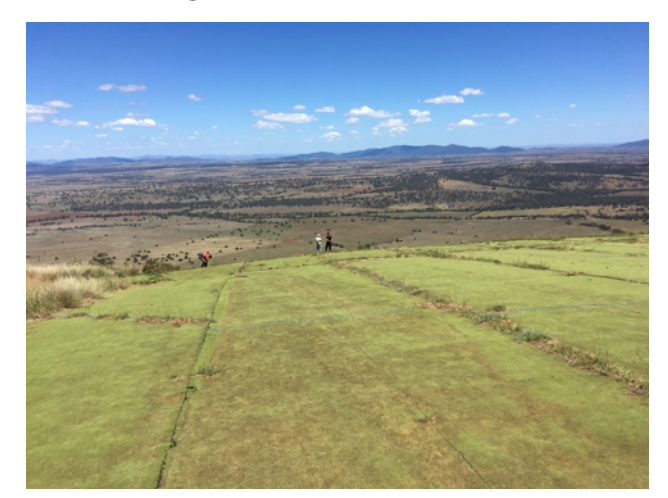
View from top of Mount Borah where the hang gliders take off from