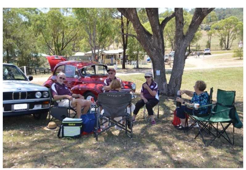
Lunch time in the shade at Quirindi Rural Heritage Village. Miniature railway operating in the background.