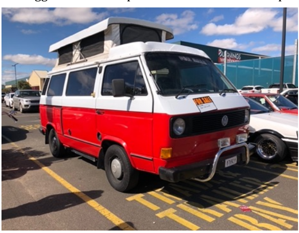
David's 1984 Combi Van - now for sale