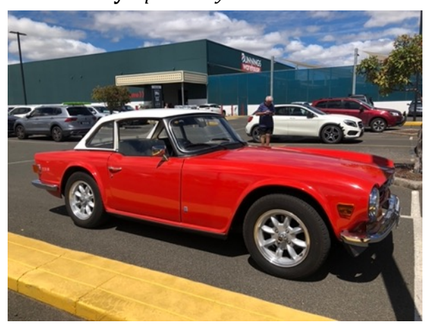
Gregg's 1974 Triumph convertible with hardtop