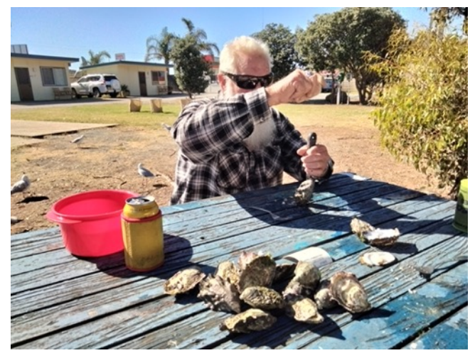
Oysters fresh off the boat - nothing better