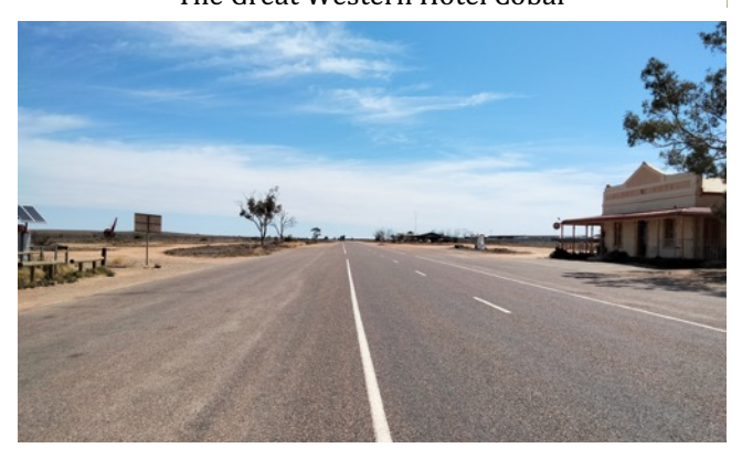
Wide open spaces