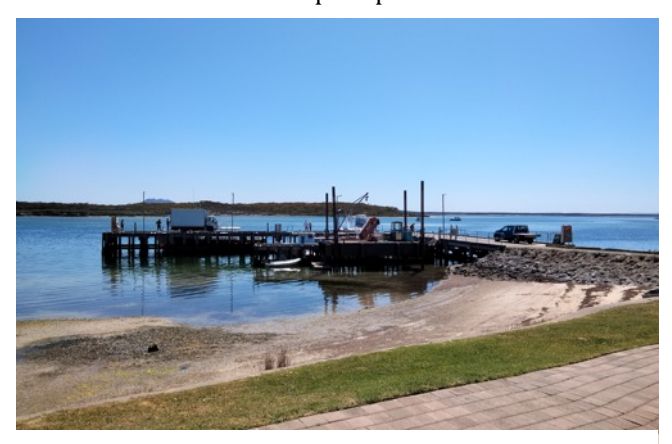
Fishermen's Wharf - Port Lincoln