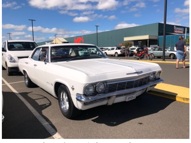
Jock Hoy's 1965 Chev Impala