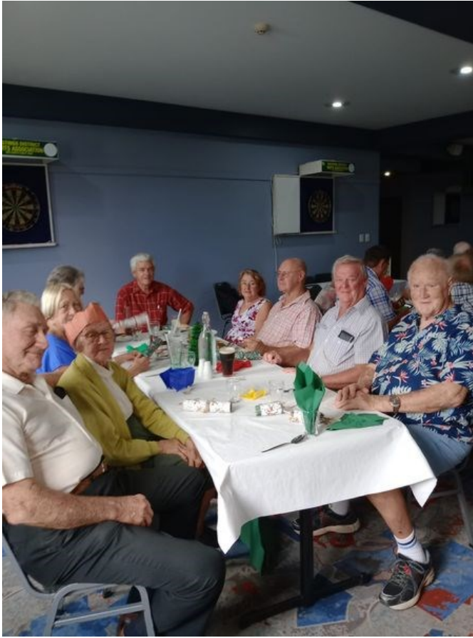
Members at the December 2023 Club Christmas Party

From THE EDITOR G'day Members. Please send me any details of visits to events or museums with a story and photos that may be of interest to club members.