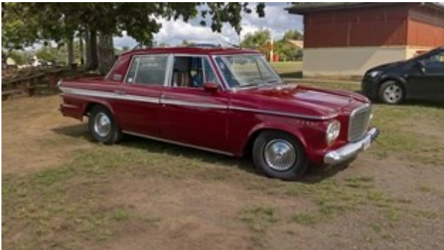
A rapley restoration

How many Irish men does it take to change a Light Bulb .Three, one to hold the bulb and 2 to turn the ladder.